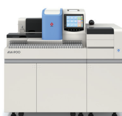
AIA-900 with 9 tray sorter 90 Tests Per Hour Also available with 19 tray sorter