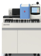
AIA-900 Loader Model 90 Tests Per Hour