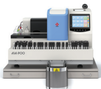
AIA-900 Benchtop 90 Tests Per Hour